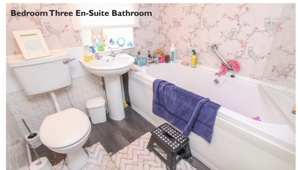
Bedroom Three En-Suite Bathroom